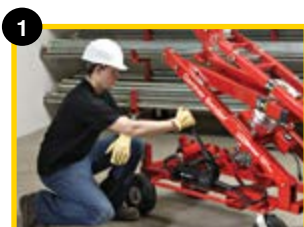
1 Pump main boom to 30°