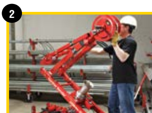
2 Flip booms into position and lock