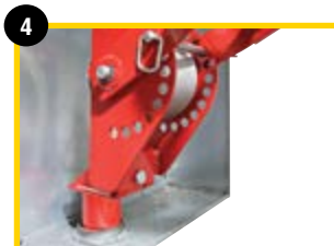
4 Place in conduit