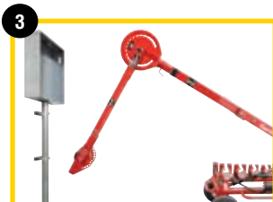
3 Align with conduit, properly adjust booms